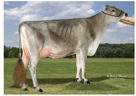
New View C Bravo