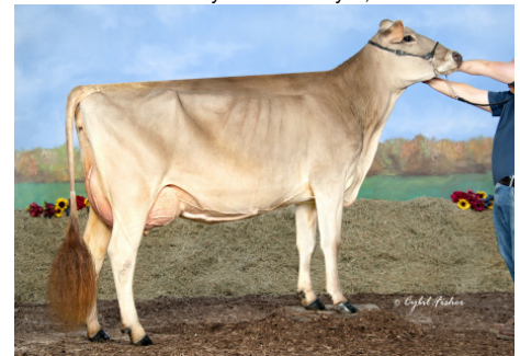
Bo Joy Carter Glitter-TW