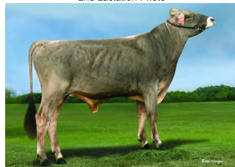
54BS577 SILVER ET*TM