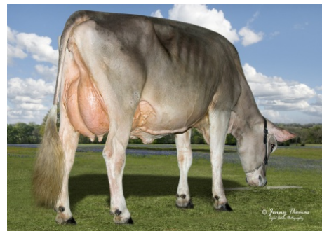
Dam: La Rainbow Sweet Silk ETV 'E91 E 91 MS' 2nd Lactation Photo