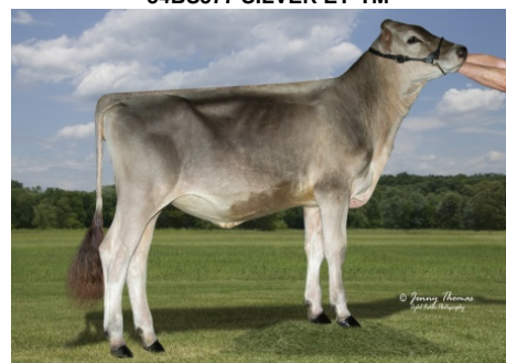
La Rainbow Silver Sweet Vibrant Owned by La Rainbow Farm, Ohio