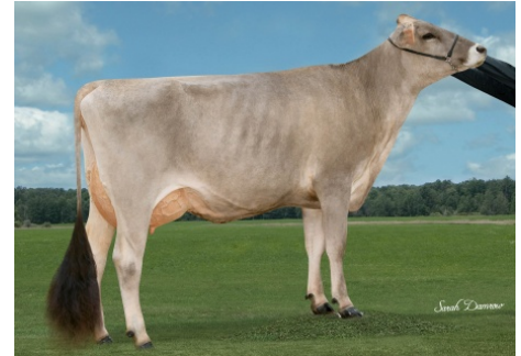
HF Lucky Darling 4629 Owned by Hendel Farms, Minnesota